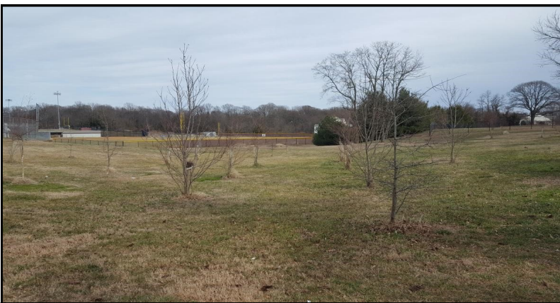
Students replanted many large mowed areas of Broadneck HS campus to assist watershed pollution reduction goals.

Challenges: As a suburban school in an altered landscape, the forest acreage is impacted by invasive species and periodic litter, which becomes action learning in planning and carrying out removal. Learning to embrace and include property owners adjacent to the school's forest has been helpful, and shows students they can continue these actions once they are out of high school.