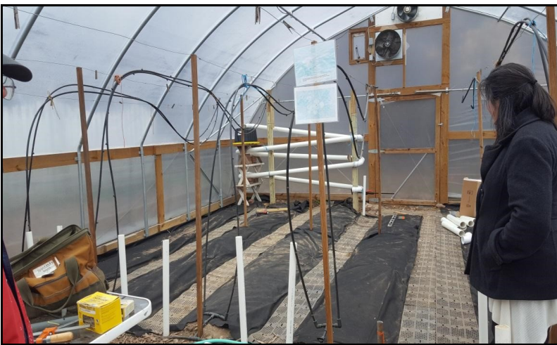
Broadneck students assist in building hydroponic systems in Goshen Farm greenhouse, with volunteer help.