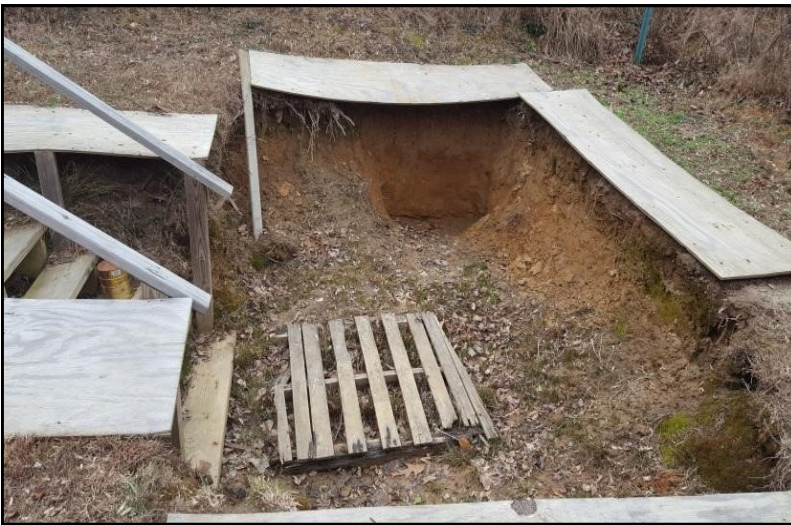
Soil profile study pit at nearby Goshen Farm, training many students in statewide Envirothon competition.